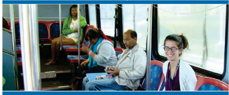
Peoria / Riverside Corridor