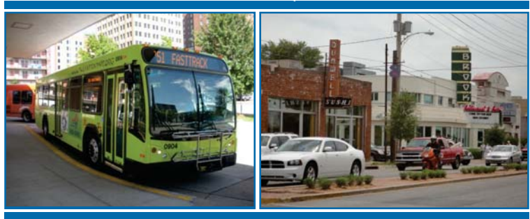
Peoria / Riverside Corridor